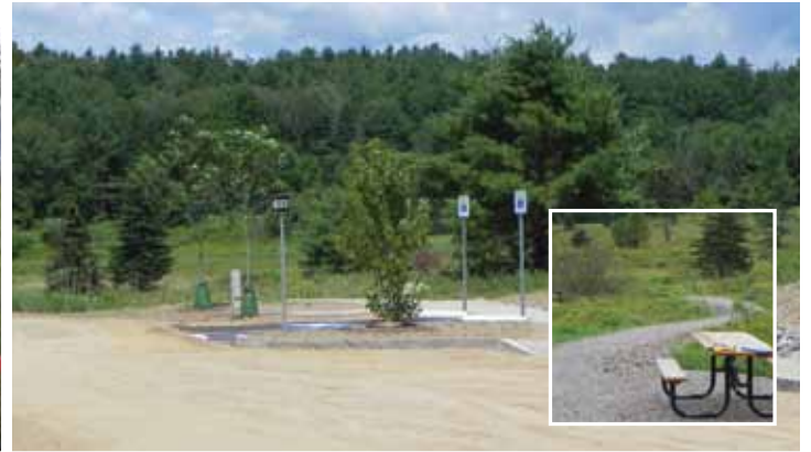
Highland Farm Preserve's newly constructed parking lot and the region's 1st universal access trail.