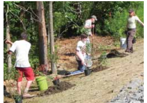
Volunteers plant native shrubs for the beautification of the parking area.