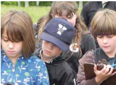
Third Graders from Coastal Ridge Elementary School survey and record habitat restoration photo points.