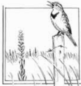
Open upland

To renew: visit yorklandtrust.org . Thank you.