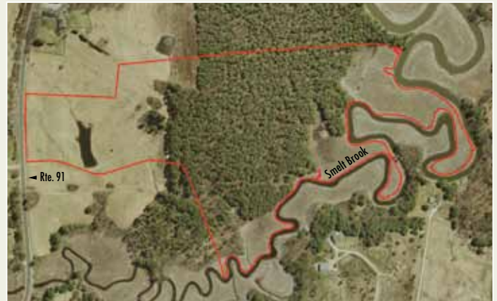
Aerial photo of 42-acre Smelt Brook Project area.

Additional, major funders to the project included the Town of York, the Elmina B. Sewall Foundation, Maine Coast Heritage Trust, the Maine Community Foundation, the North American Wetlands Conservation Act, Fields Pond Foundation, and the MARPAT Foundation.