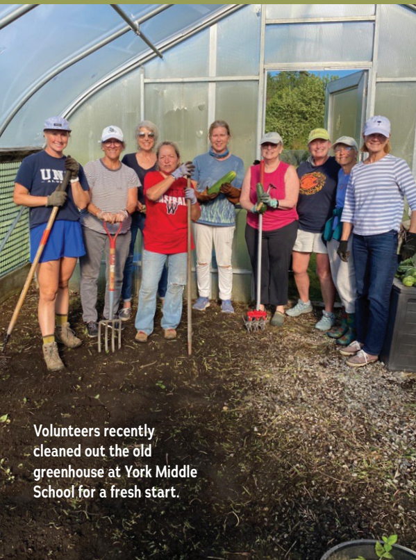
Volunteers recently cleaned out the old greenhouse at York Middle School for a fresh start.

We are thrilled to announce a newly sprouted collaboration between Old York Garden Club, York Land Trust, and York Middle School. With a common interest among these groups to raise awareness about native plants and local ecology, an idea was born this past summer to revitalize the old York Middle School greenhouse for a new hands-on educational program. The non-functioning YMS greenhouse was recently cleaned up by a crew of volunteers, including Maine Master Gardeners, parents from York Middle School, and Old York Garden Club.