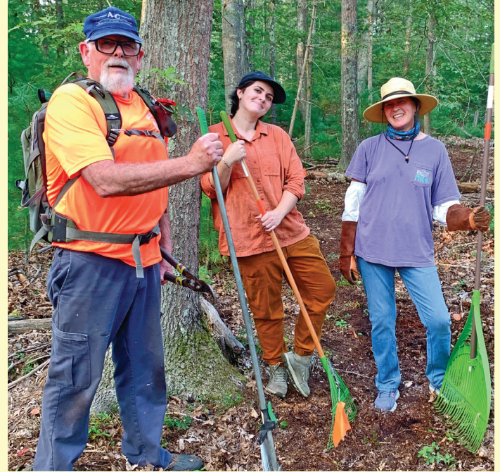
Stewardship volunteers and staff brushed out and cut a new trail system at Lafcadio's Woods this summer.